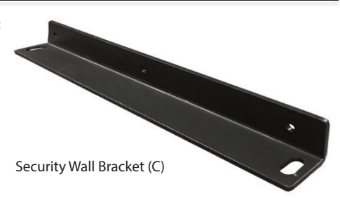
Note: Due to varying wall structures, hardware (screws and anchors) for mounting the wall bracket are not included.