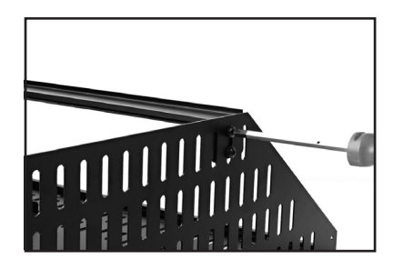
Step 3 (Optional) - Attach the top equipment brace(s) to the shelf sides using screws provided.