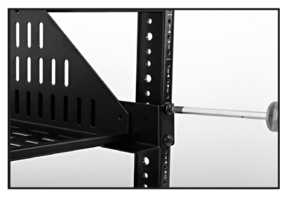
Step 2 (Optional) - Attach the rear support brackets to the rack frame using the supplied washers and screws.