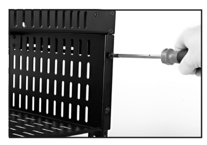
Step 1 - Slide the shelf into the rack. Attach the front shelf sides to the rack frame using the rack-supplied hardware or any 10/32 screws.