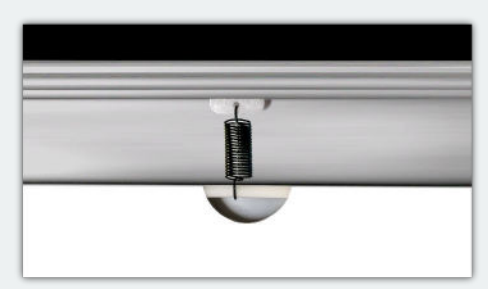
Screen material is held perfectly flat with Severtson Flex™ RTS

Note: The most common sizes and aspects are listed here. Visit severtsonscreens.com/model/DF or contact a sales representative for more available sizes and specifications. Custom sizes available .