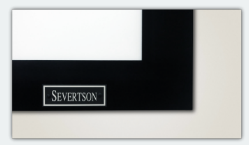
The beveled velvet-wrapped 4" frame provides a clean, crisp viewing edge.